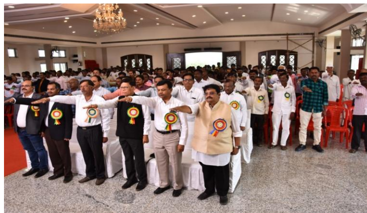
Taking safety oath by the dignitaries