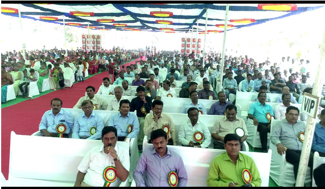
Audience on the occasion