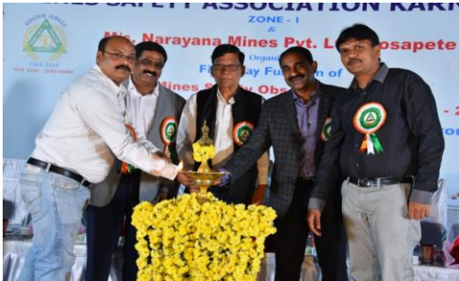
Dignitaries being inaugurating the function