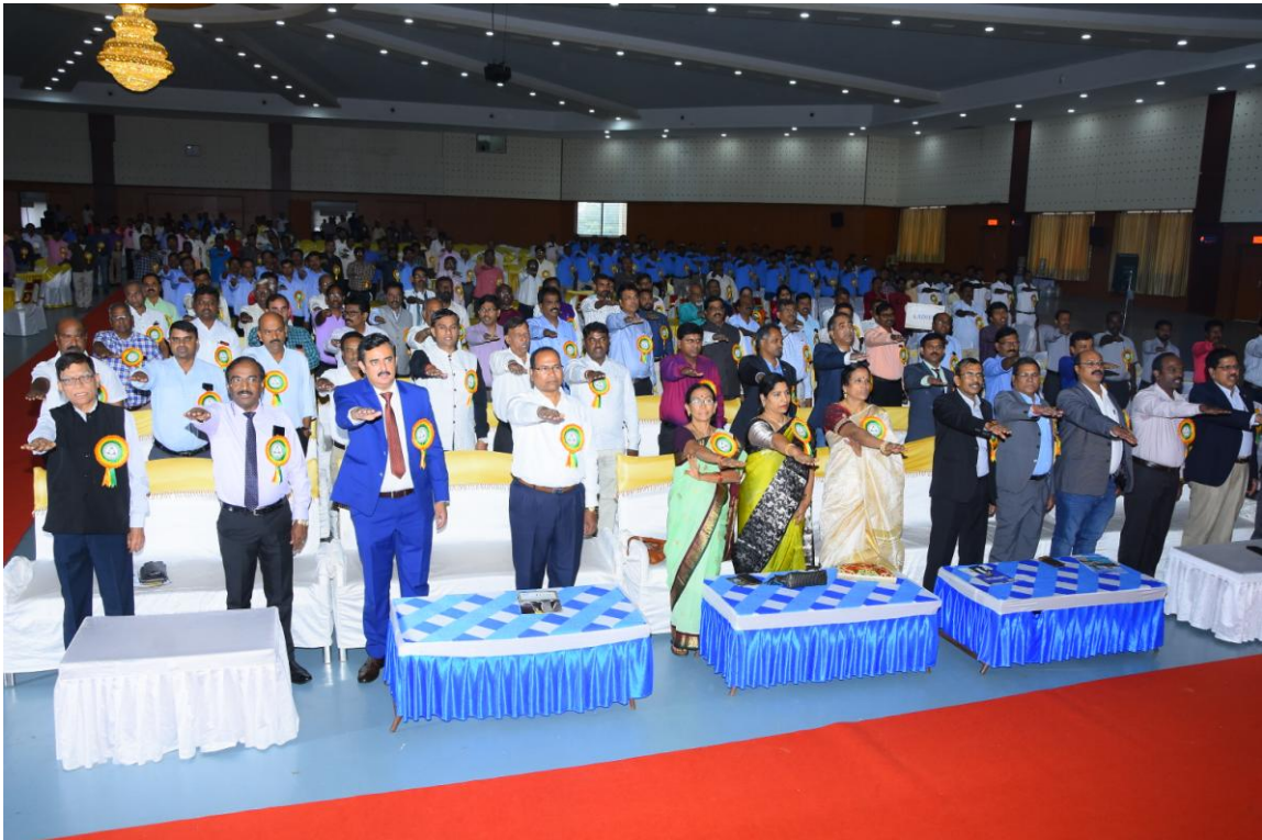
Safety oath taking ceremony