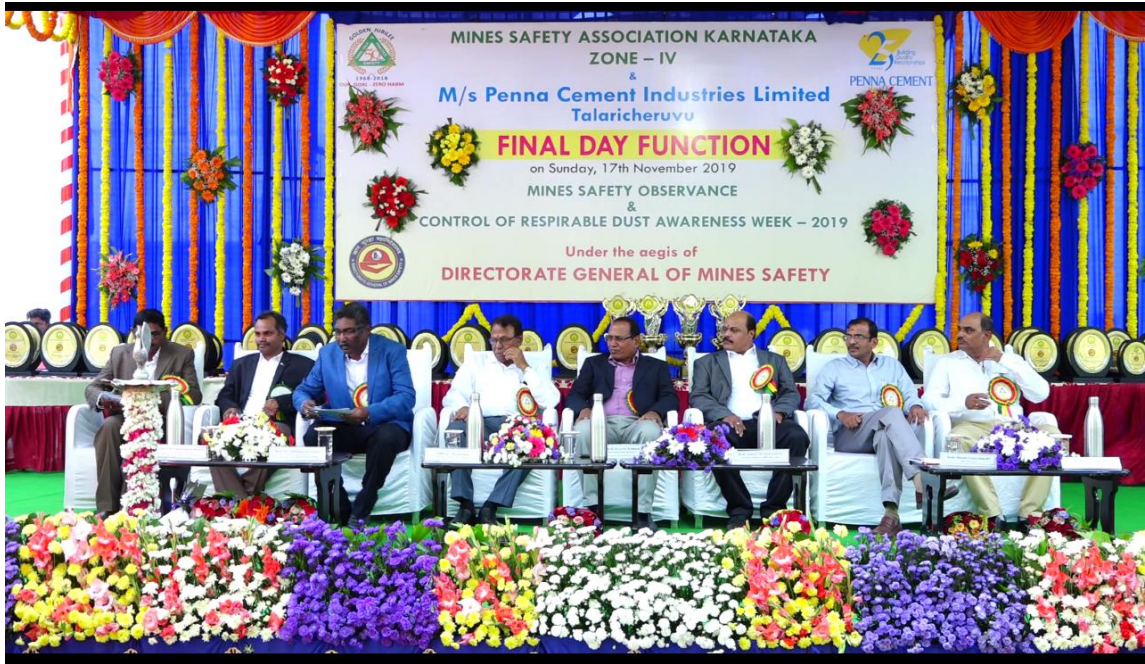
Dignitaries on the dias