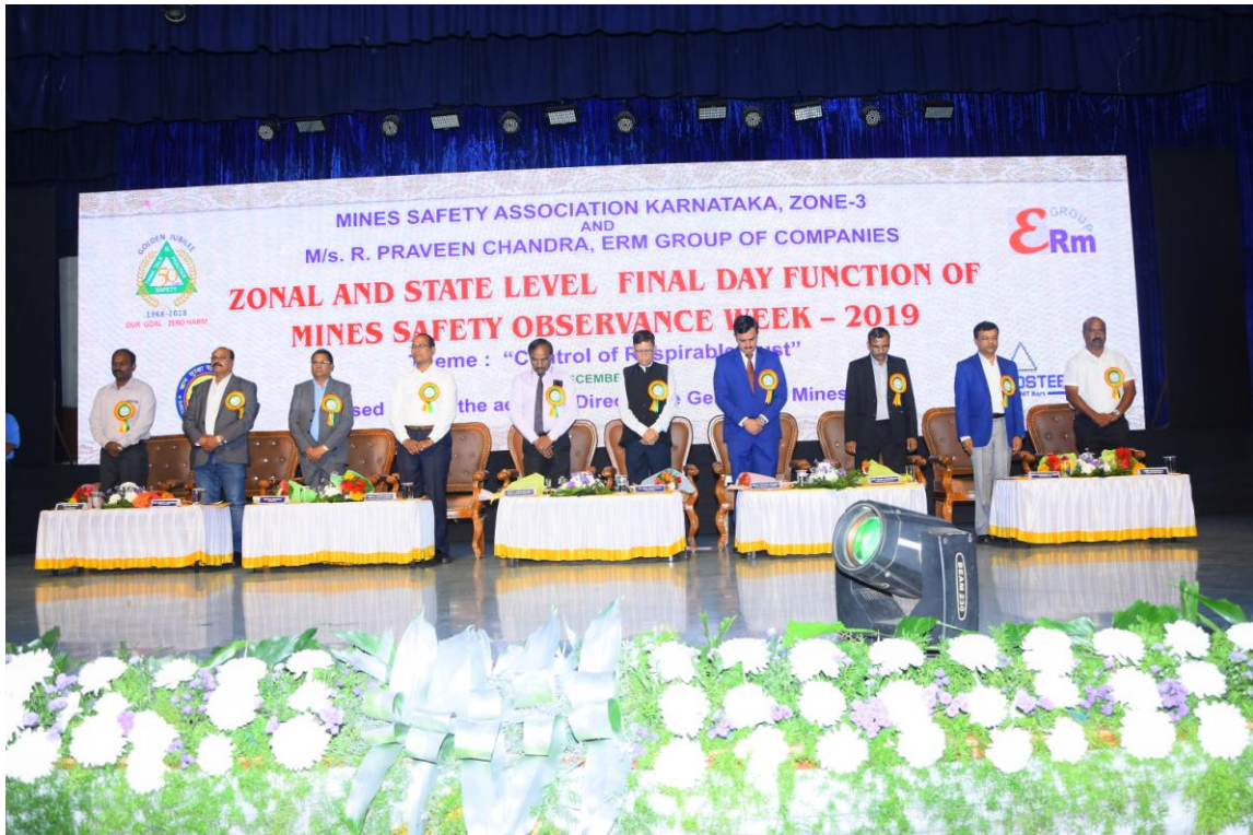
Observing two-minute silence for departed souls