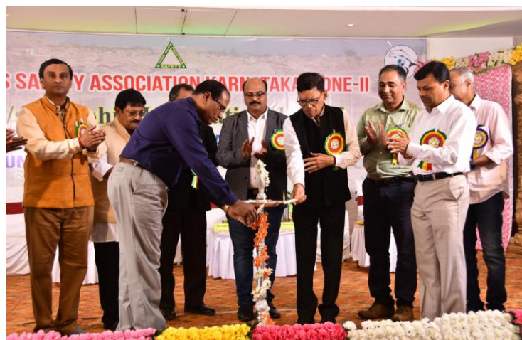
Dignitaries lightning the lamp