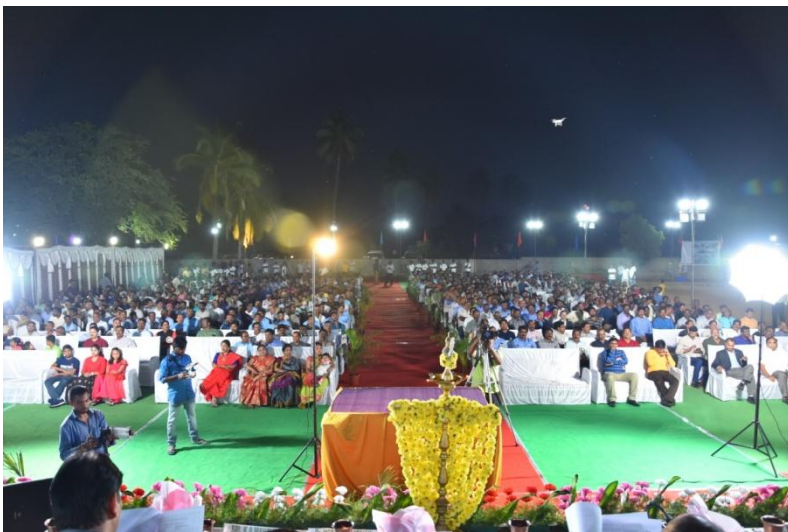
Gathering at the function