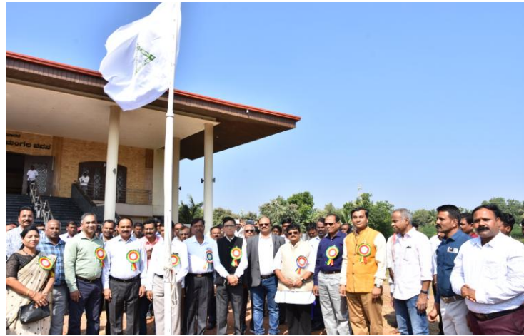
Safety flag hoisting