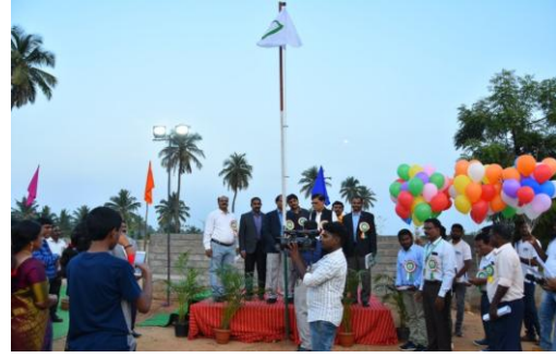
Taking safety oath by dignitaries