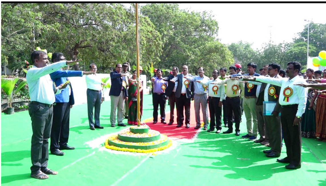
Safety oath taking ceremony