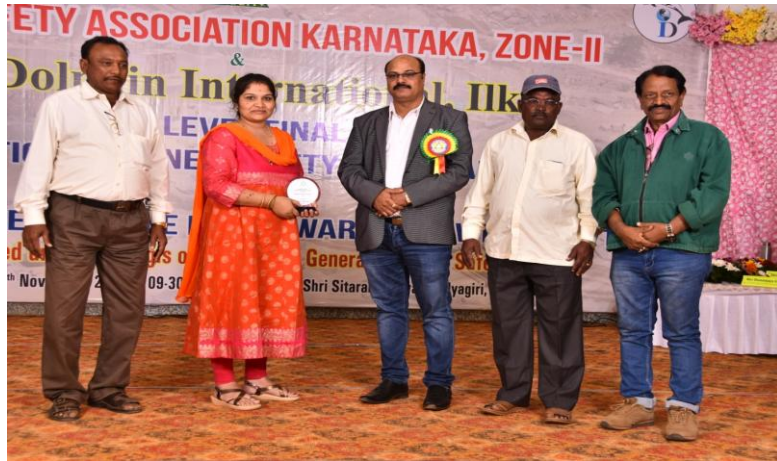
Cultural Programme on the occasion