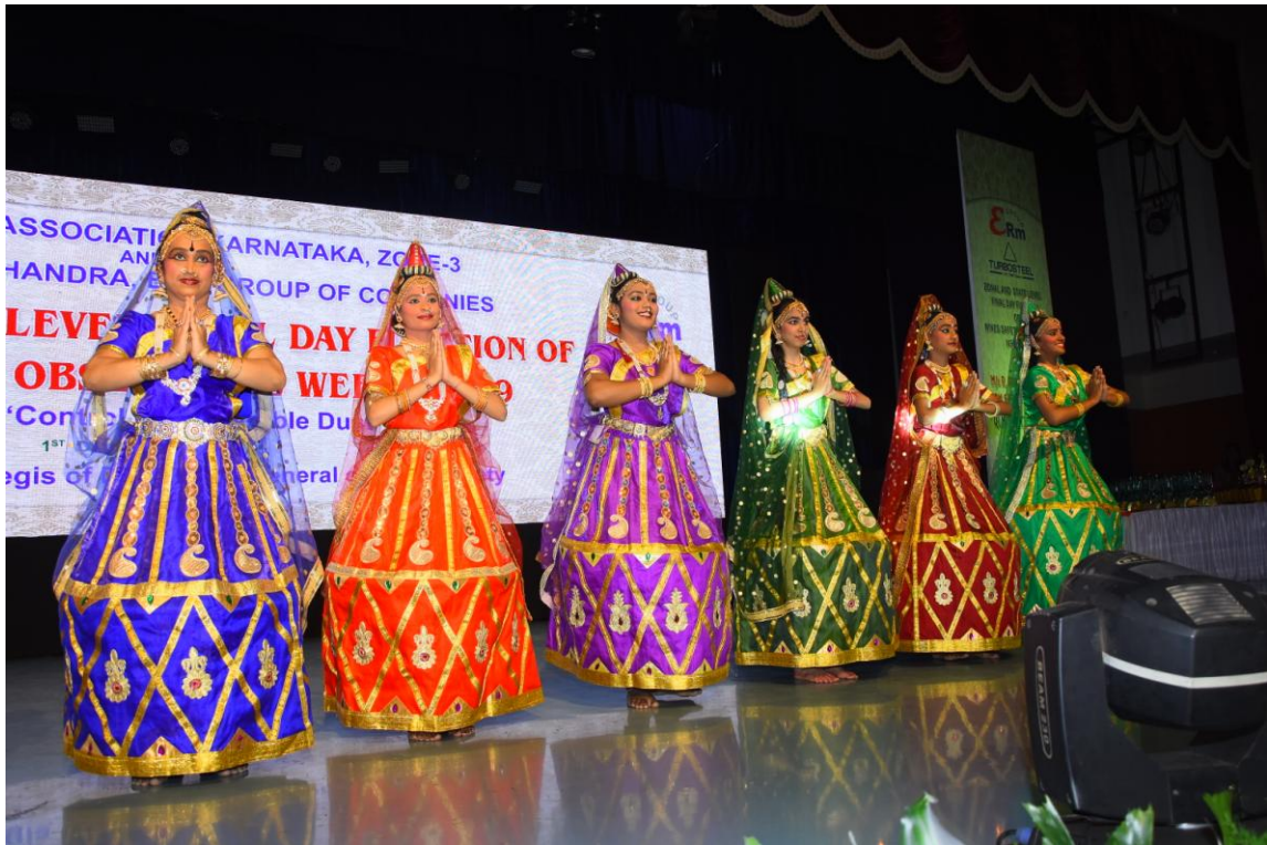
Cultural programme on the occasion