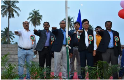
Safety flag hoisting by Dignitaries

M/s. Sri Kumarswamy Mineral Enterprises (SKME)