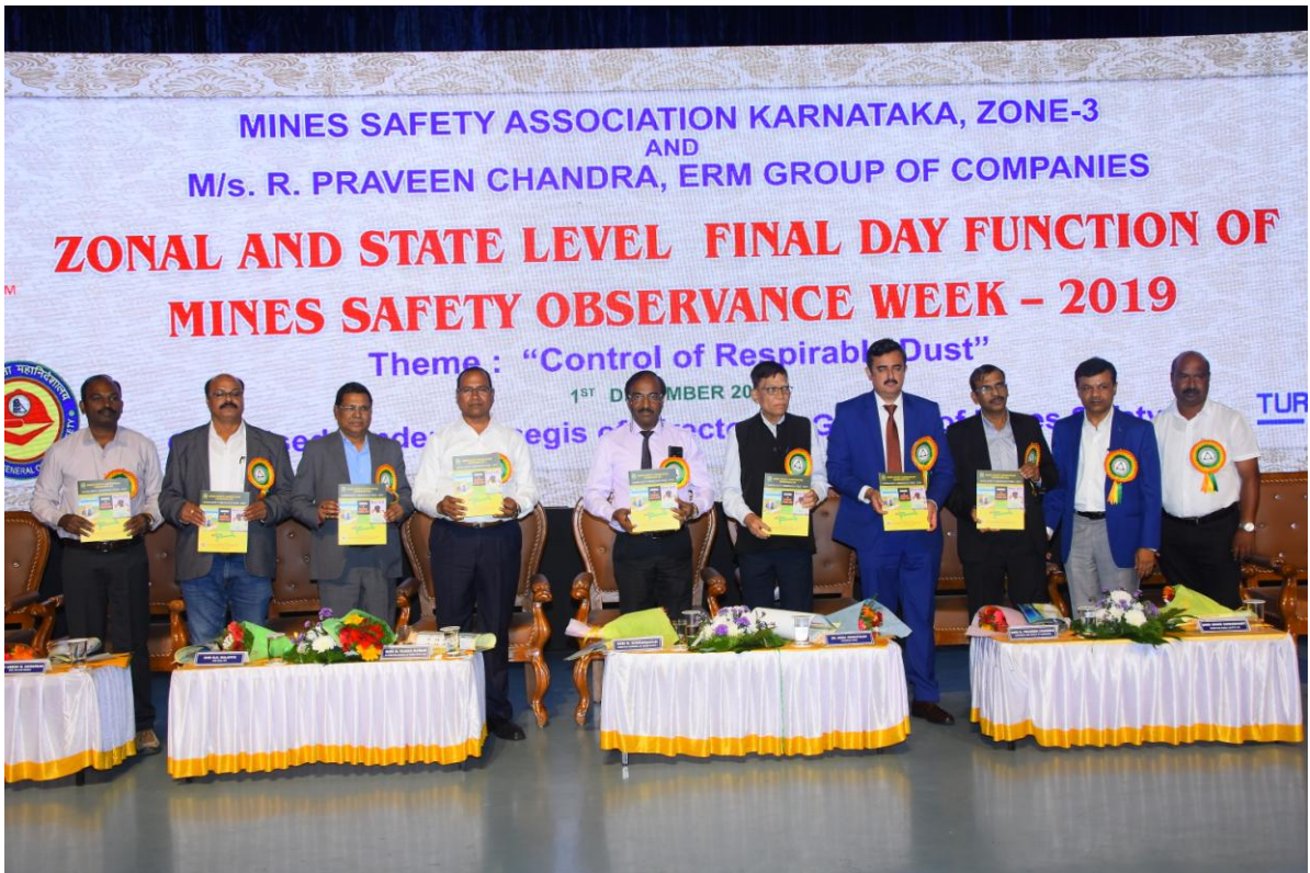
Releasing of Safety week Souvenir by the dignitaries on the dais