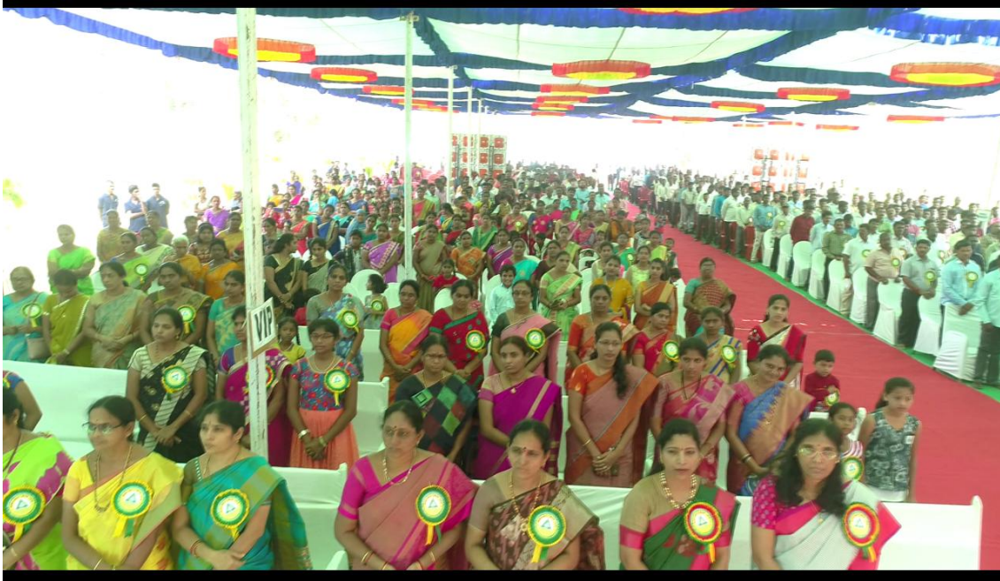
Audience on the occasion